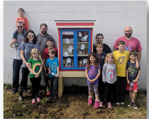
Blessing Box volunteers.

As soon as Ohio received the “Stay at Home” order, the leadership of the church began finding ways to prioritize our connections to our community and each other. Rather than beginning with a focus on the costs of ministry at LUMC, the decision was made to prioritize support for our Local Food Pantry, Bloom Crisis Fund, and a growing support for the Blessing Box program of the surrounding region (see related story). We also reached out to our Ministry Partners and were able to provide special gifts in support of the work at Henderson Settlement (Frakes, KY) and Good Works Ministries (Athens, Ohio).