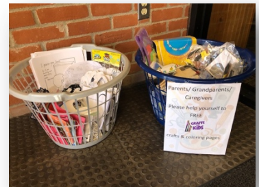
Crafts at church to take home.