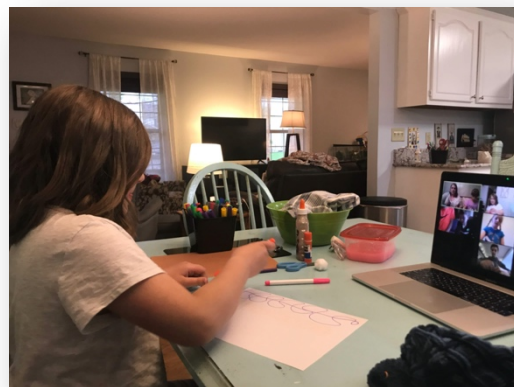
Craft time during Growing Together's Zoom meeting.